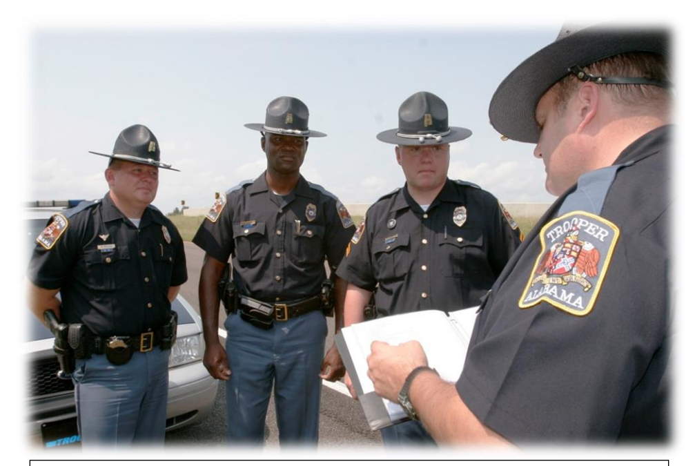
Troopers perform a variety of enforcement activities to prevent traffic crashes, injuries and fatalities.

Again, the bulk of the grant funding was spent on personnel costs: $487,405.52. One Chevrolet Tahoe and the associated equipment was purchased using the New Entrant Grant at a cost of $51,634.95. During FY2015, Troopers assigned to the conduct safety audits surpassed the number of audits outlined in the grant agreement (425), completing 671 safety audits.