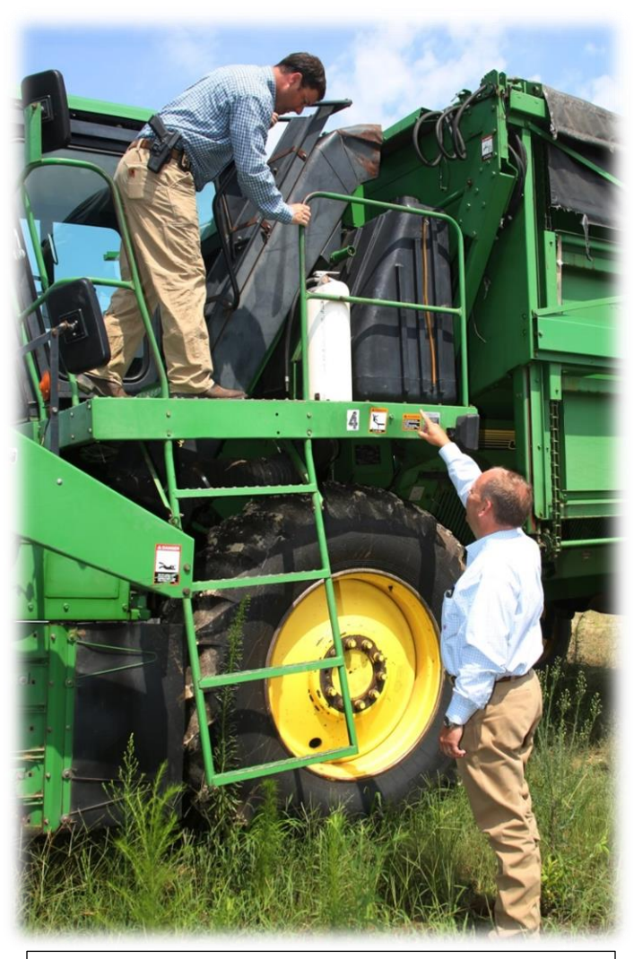
ARCU was created in 2013 as a task force concentrating on crimes pertaining to livestock and the theft of agricultural equipment.