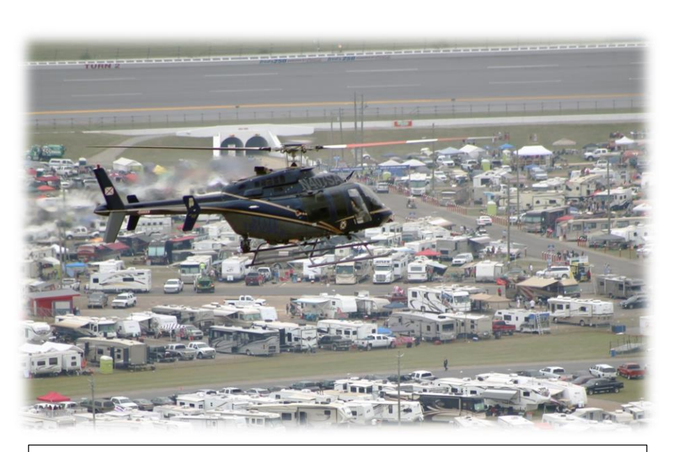
The Unit often patrols events from the air.

The maintenance section of the unit consists of two mechanics and one maintenance supervisor (who also serves as a pilot for ALEA Aviation), all of whom are based in Montgomery. They are responsible for maintaining 14 flyable aircraft in all three bases of operation (Montgomery, Cullman and Fairhope). In addition, maintenance staff members are trained to perform rescue operations when needed because of limited