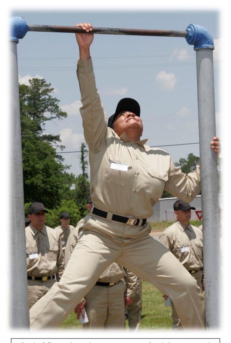
Physical fitness is an important part of training at ALEA's Alabama Criminal Justice Training Center in Selma.

Advanced Law Enforcement Rapid Response Training (ALERRT) Advanced Roadside Impaired Driving Enforcement (ARIDE) Air to Ground Search ALEA Annual Training & In-service (arresting officers) ALEA Employee Orientation Basic Accident Investigation Basic Traffic Homicide Investigation Below 100 Beretta 1301T Shotgun Armorer Boat Operations