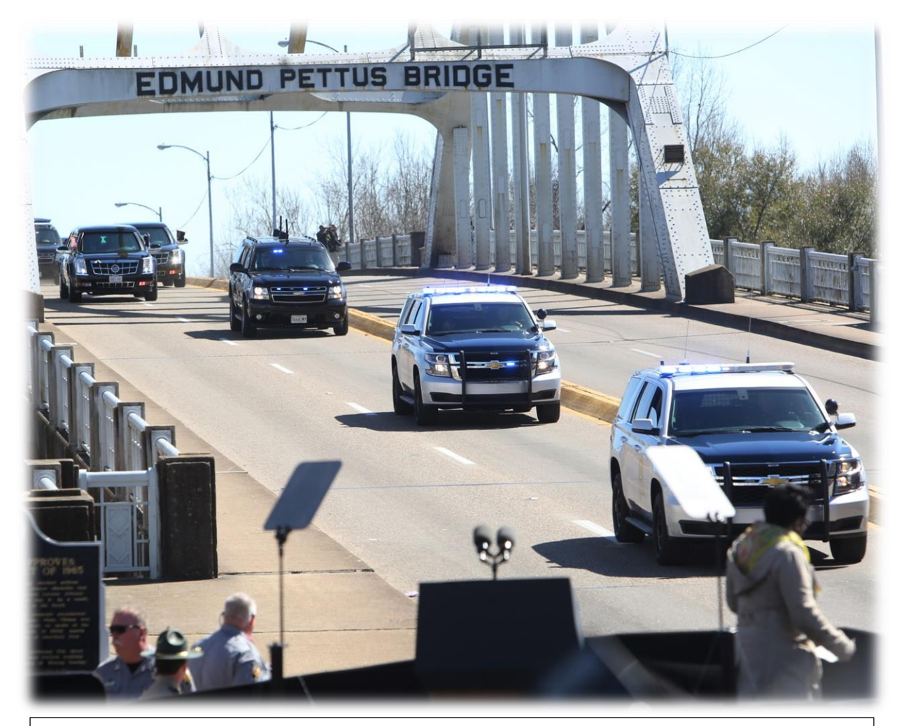
Highway Patrol joins other ALEA divisions to serve during special events across the state, including the famous Selma bridge crossing and march to Montgomery.