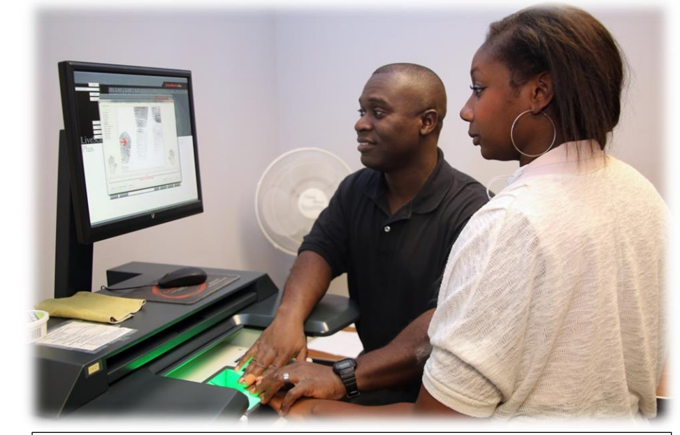
Certified latent print examiners use modern techniques to effect positive identification.

The Latent Print Section personnel process crime scenes and crime-scene evidence to obtain fingerprints of individuals for suspect identification