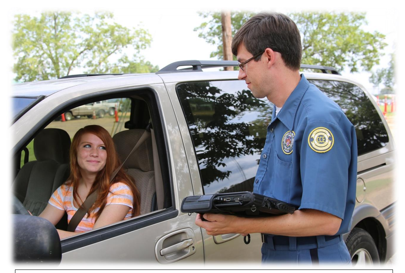
Driver License Examiners conduct road skills tests in addition to issuing and renewing licenses.