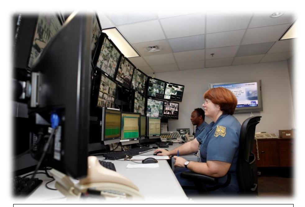
ALEA's Dispatch Operations section comprises communications centers in three regions of the state: North, Central and South.