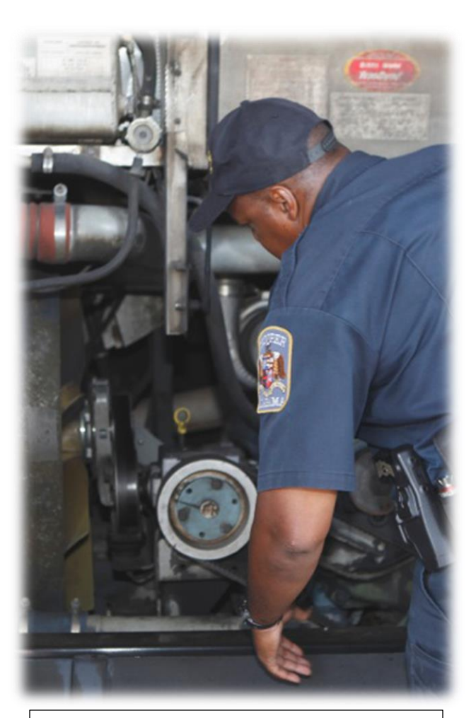
Troopers assigned to Motor Carrier Safety inspect assorted commercial vehicles.

Motor Carrier Safety spent the majority of its grant funding on personnel and fringe costs totaling $2,313,094.66. In addition to personnel costs, the MCSD purchased and equipped eight Chevrolet Tahoes at a cost of $242,774.75. The MCSD did not expend all grant awarded funds by the end of the grant