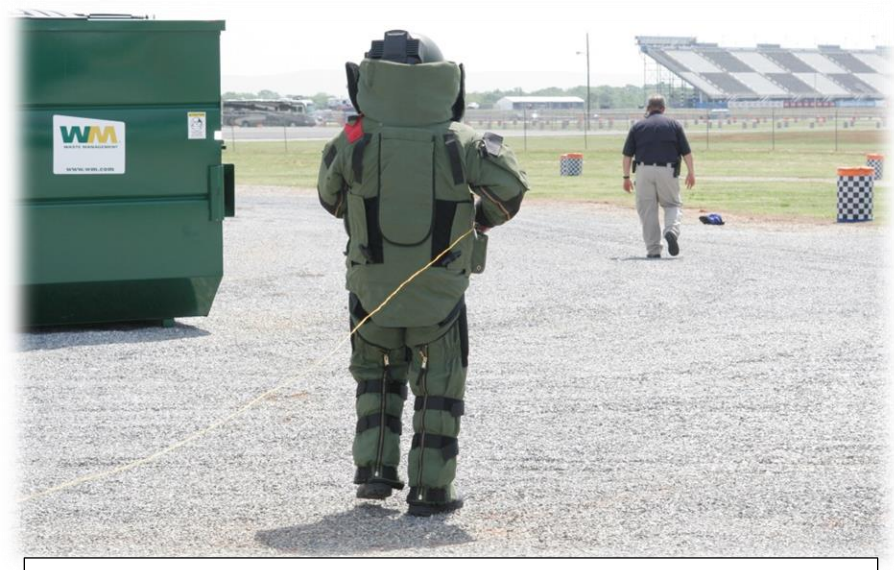
Bomb Technicians are trained to respond to improvised explosive devices (IEDs), unused or discarded explosives, suspicious packages and bomb threats.

They also take part in additional training each year through outside agency courses, and they participate in training scenarios across the state. In addition, these agents are tasked