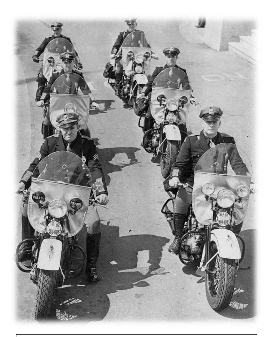
The agency's 1950s Flying Squad.

The State Bureau of Investigation is the investigative division of the ALEA. The SBI is the statewide lead for all narcotics investigations and alcohol enforcement, as well as being responsible for conducting complex criminal investigations, often in support of city, county, state and federal law enforcement agencies. Additionally, the SBI has a team of investigators who specialize in the investigation of agricultural and rural crimes.