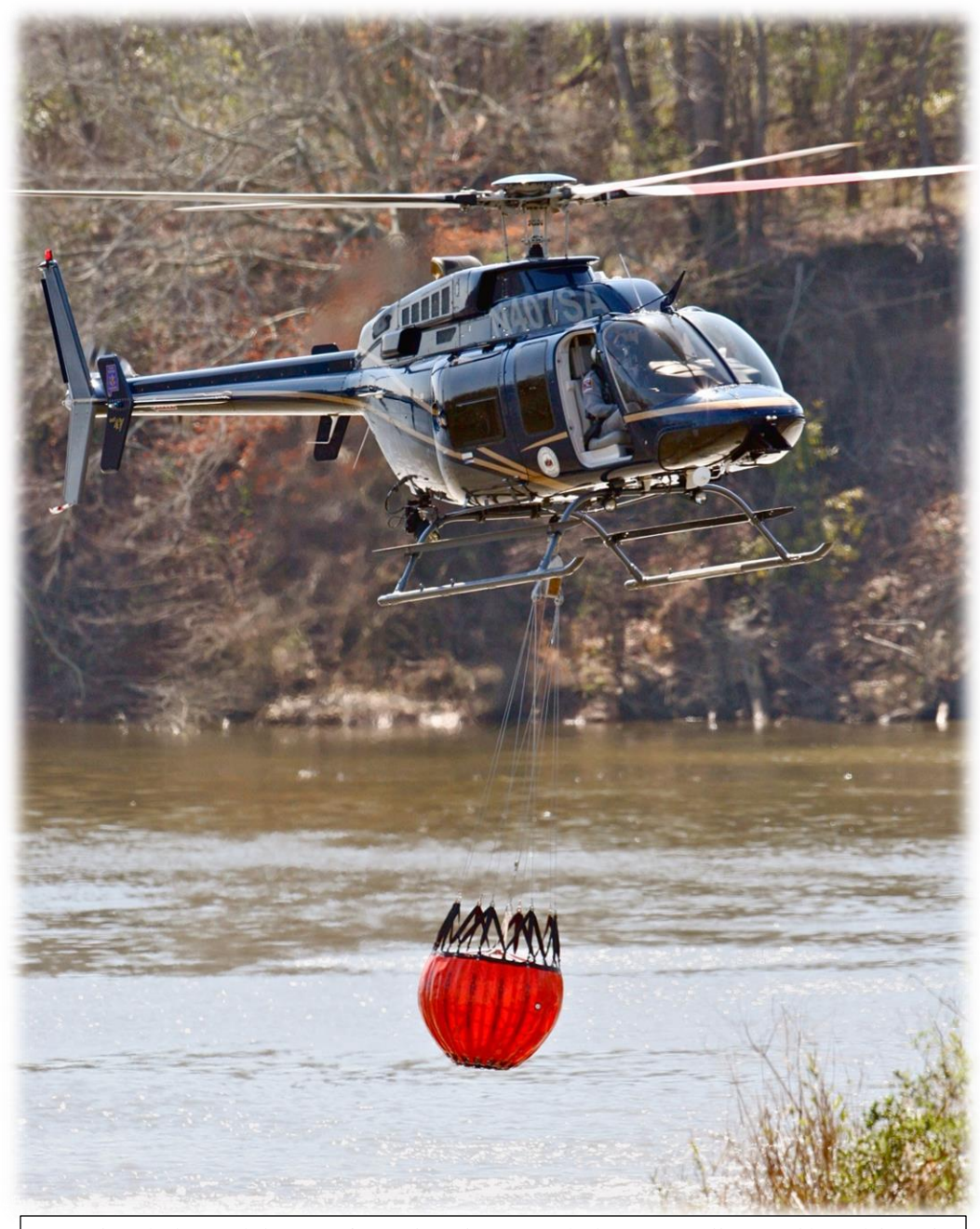
ALEA's Aviation Unit is part of search and rescue missions , as well as working with such equipment as Bambi buckets. above, to extinguish fires in wooded areas.