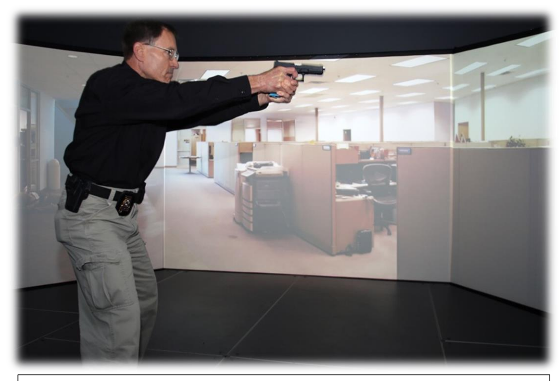
ALEA sworn officers are prepared for active -shooter response, and many of them are certified to teach programs to such civilian groups as churches and schools.