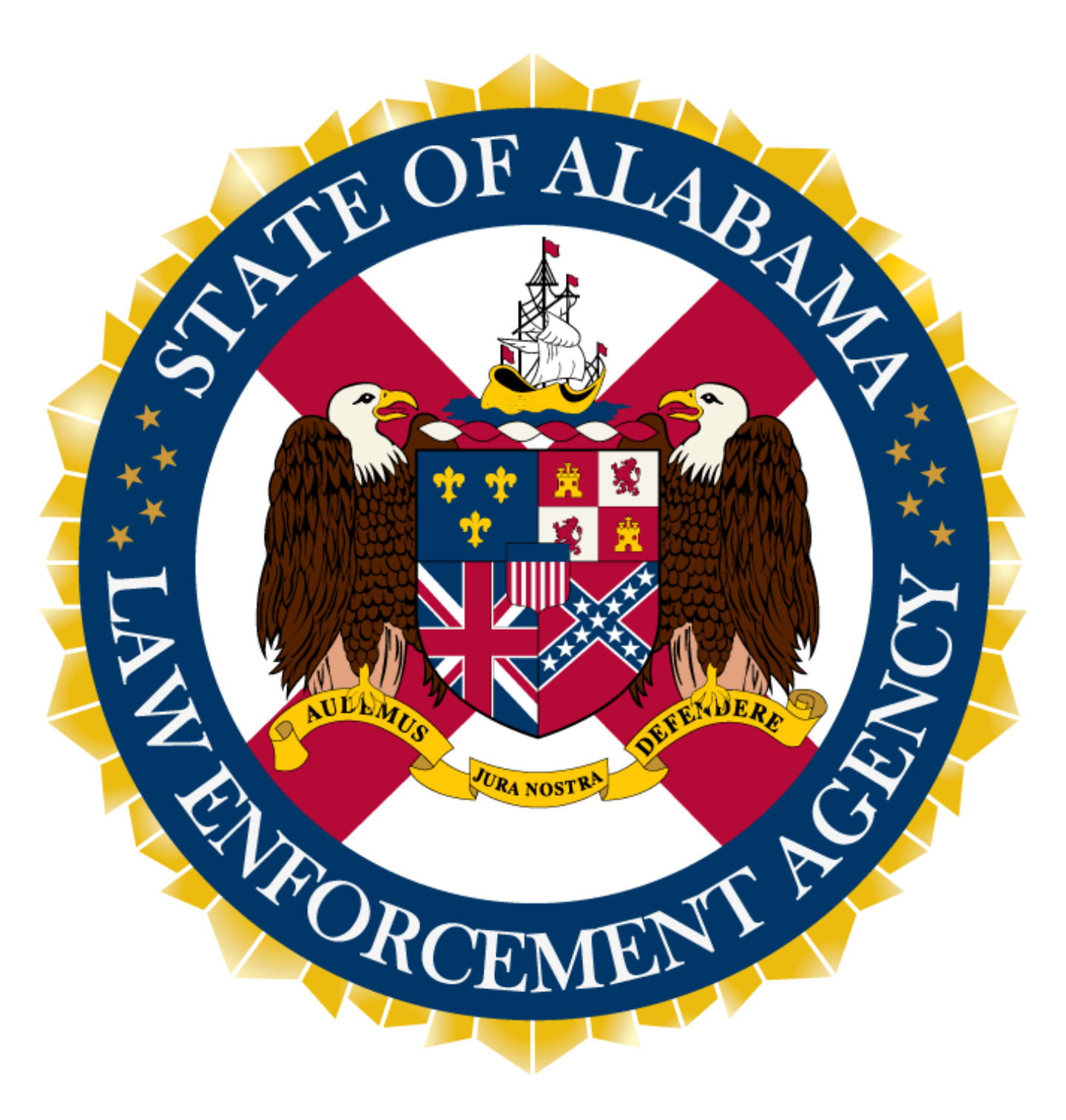
FY2015 Annual Report Alabama Law Enforcement Agency