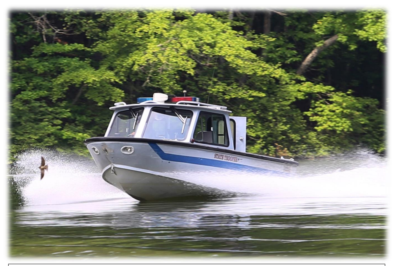
Marine Patrol Division is part of ALEA's Department of Public Safety.