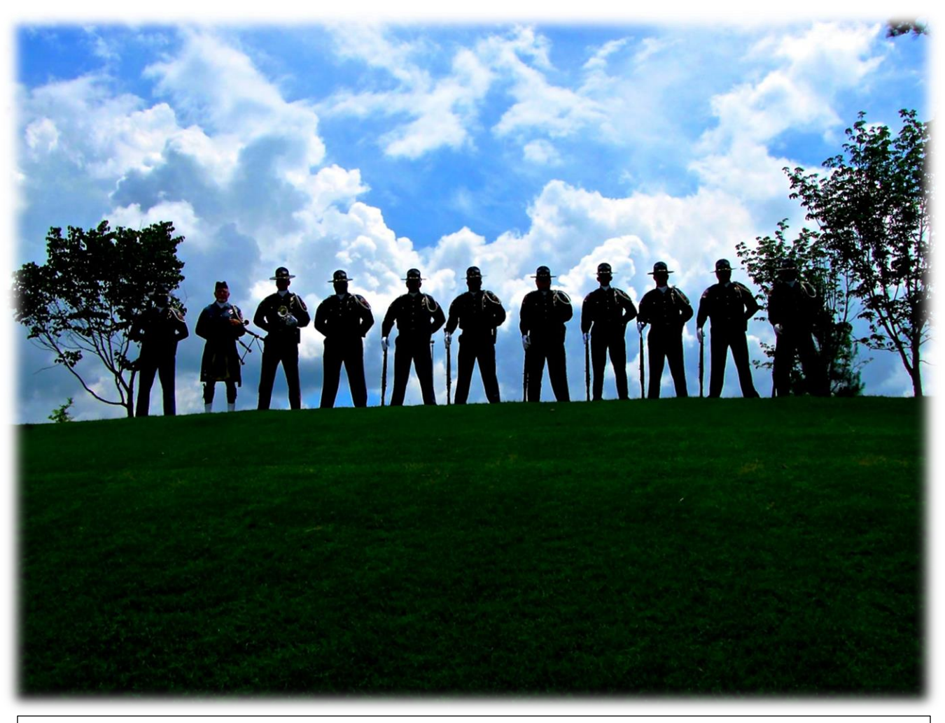
Alabama Law Enforcement Agency's Trooper Honor Guard.