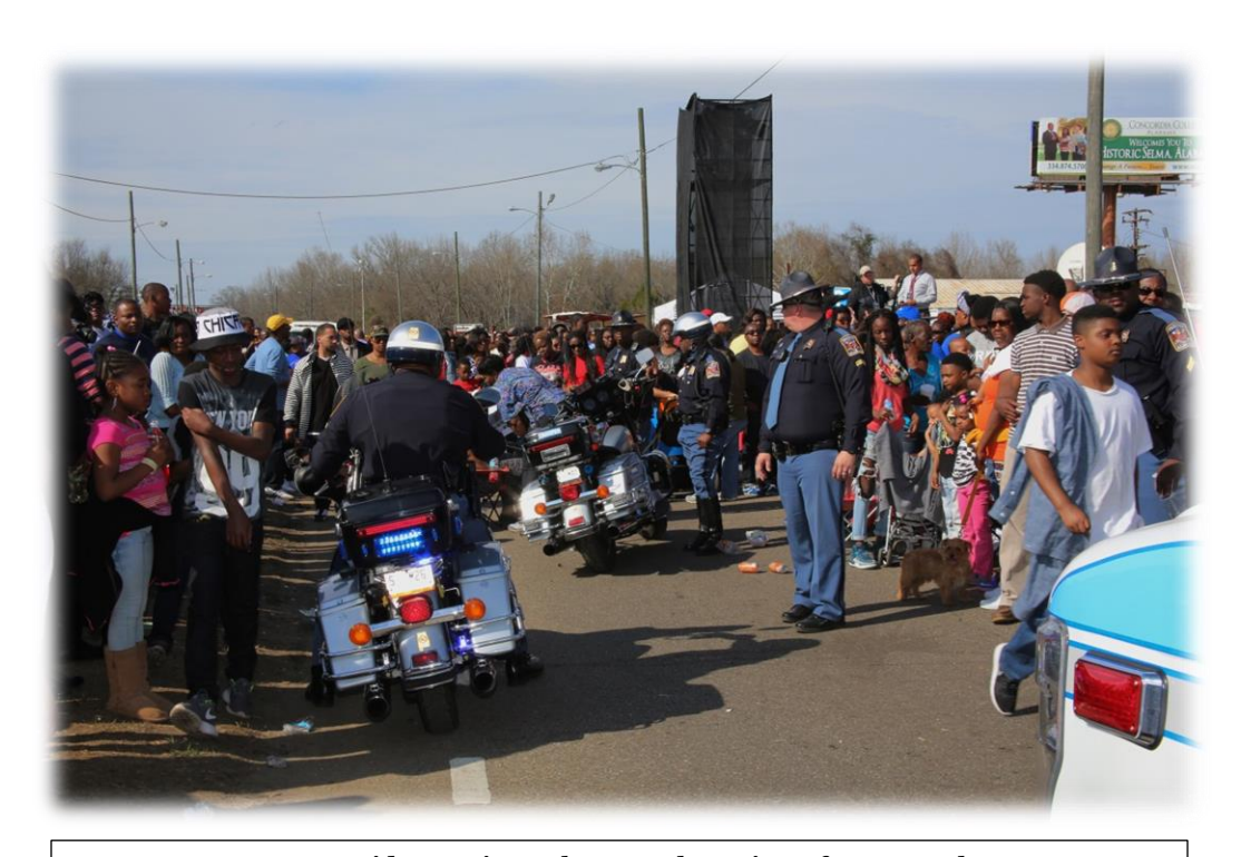
Troopers provide security as they patrol a variety of events each year.

In addition to waterway patrol, Marine Troopers were involved with other divisions of DPS in the following events: Inauguration, Mardi Gras, 2015 Selma 50th Anniversary Bridge Crossing Jubilee, Foot Wash, Talladega races (fall) and college football details. Marine Troopers also participated on Critical Response Teams and Special Operations.