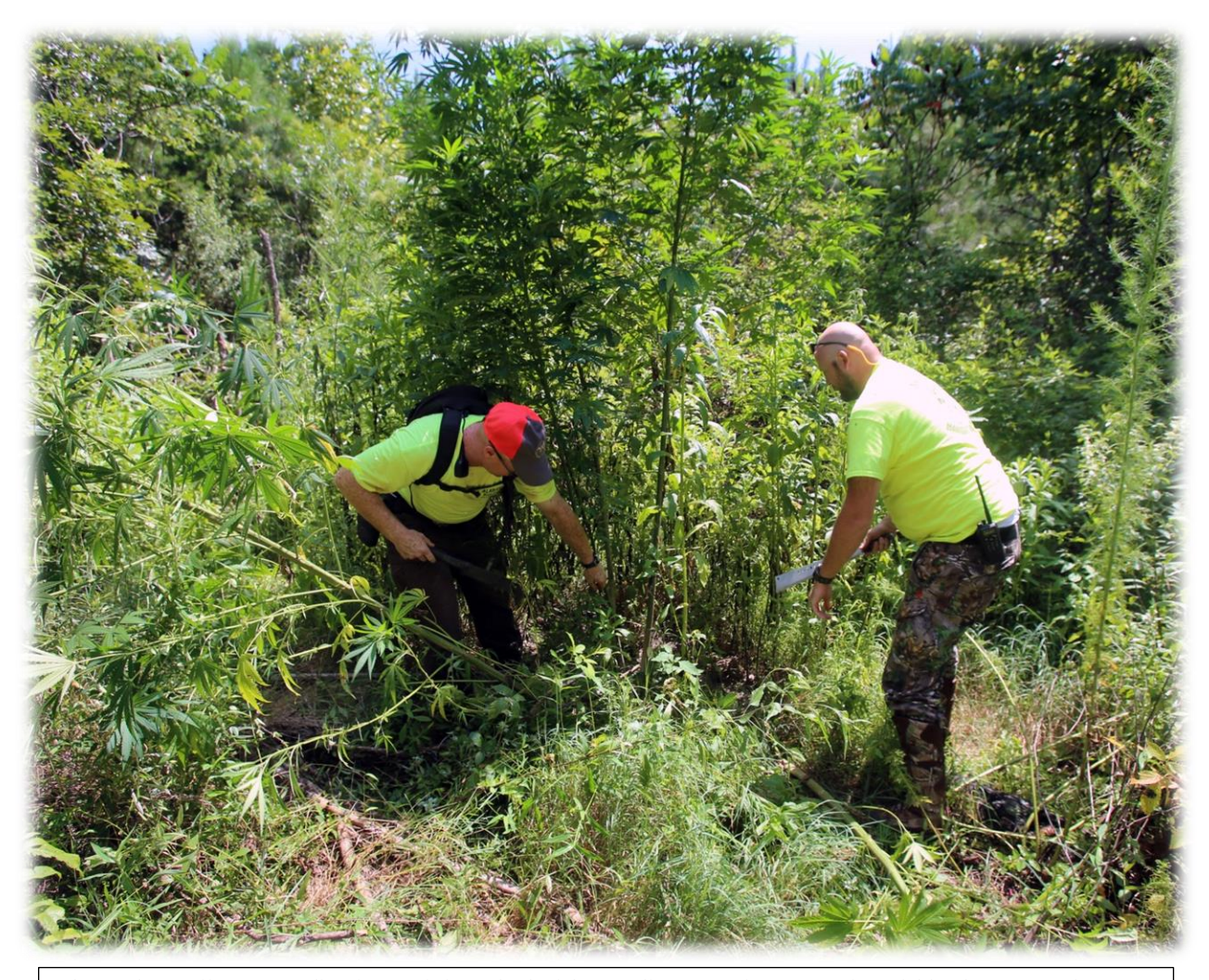
The SBI's Marijuana Eradication Unit is tasked with traveling to various counties within the state to locate, seize and destroy marijuana plants being covertly cultivated by drug dealers in Alabama.